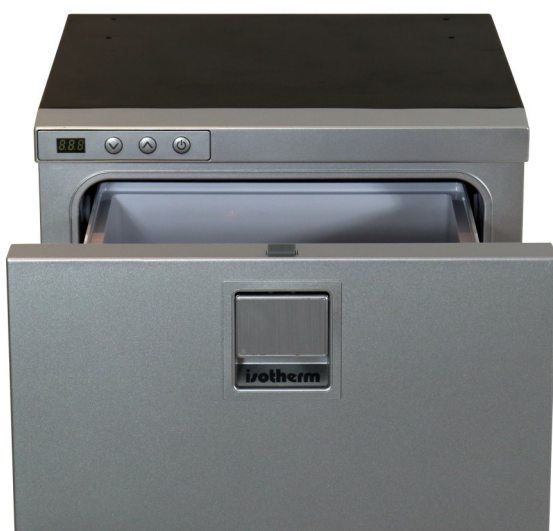
DR 16 FRIDGE / FREEZER

01/19 • Errors and omissions excepted • Printed in Australia • © Webasto Thermo & Comfort Australia Pty Ltd