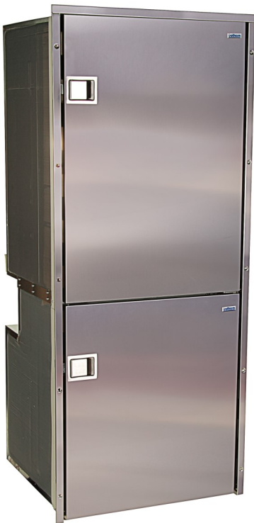
INOX Combi 195 Cruise 130 Drink on top of a Cruise 65 Freezer