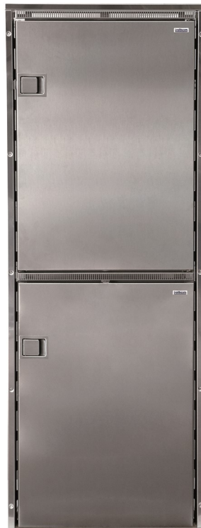
INOX Combi 220 Cruise 130 Drink on top of a Cruise 90 Freezer