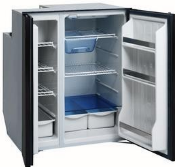
CR 200 CLASSIC