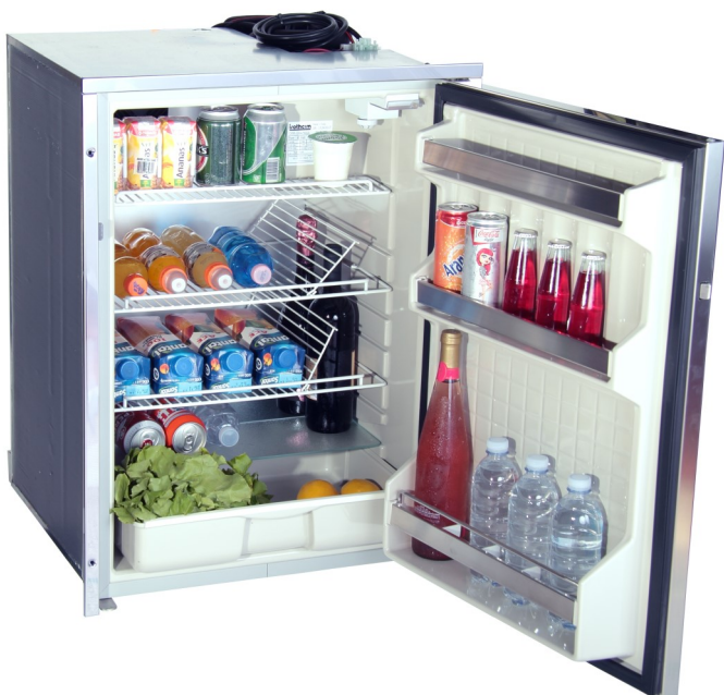
CR 130 DRINK INOX