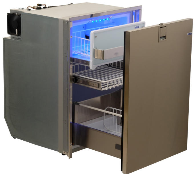
DR 130 INOX