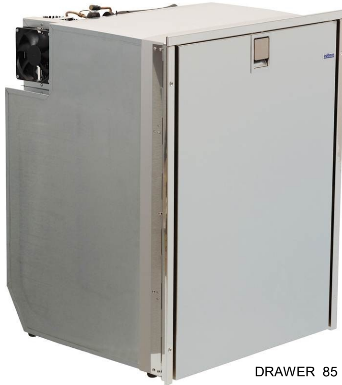
DRAWER 85 INOX

The Drawer 85 and Drawer 130 are a stainless steel refrigerator with built in freezer drawer. The main drawer door mechanism utilises robust high quality Blum rails.