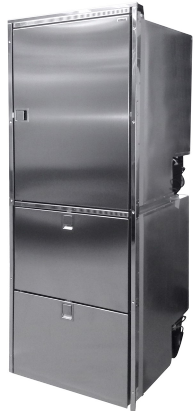
INOX Combi 320 Cruise 160 INOX on top of a Drawer 160 fridge or freezer or fridge/freezer + ice maker