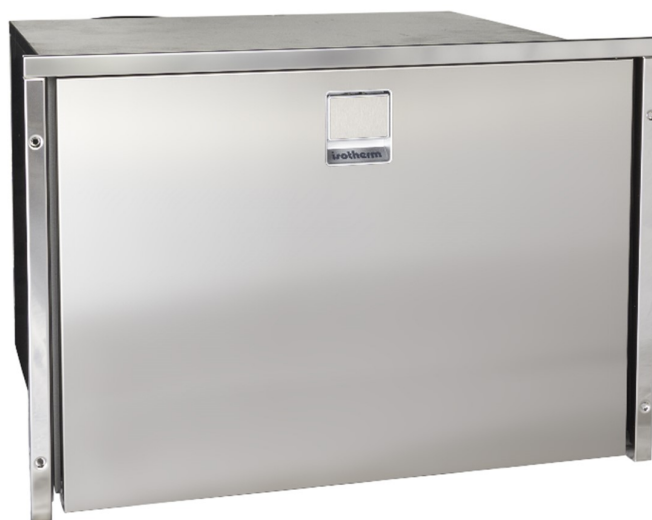
DR 70 FRIDGE / FREEZER