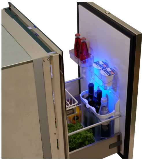
DR 130 INOX - BOTTLE RACK