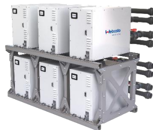
BlueCool V-PRO system

BlueCool V-PRO can easily be arranged as a system with many optional accessories: