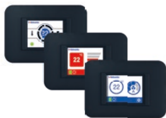
BlueCool MyTouch Display