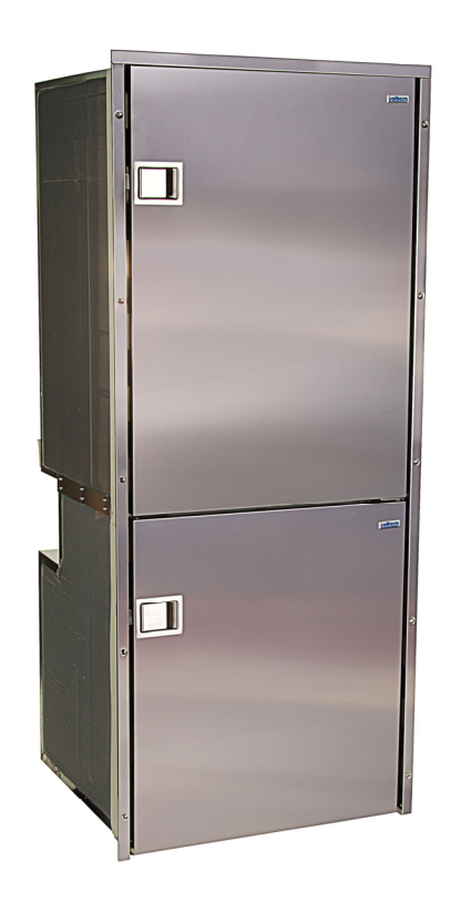
INOX Combi 195 Cruise 130 Drink on top of a Cruise 65 Freezer