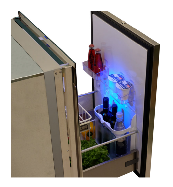
DR 130 INOX - BOTTLE RACK