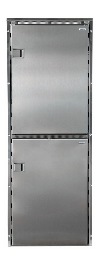
INOX Combi 220 Cruise 130 Drink on top of a Cruise 90 Freezer