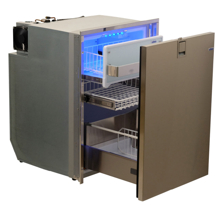
DR 130 INOX