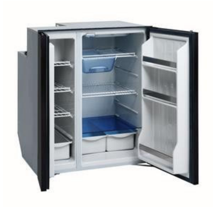
CR 200 CLASSIC