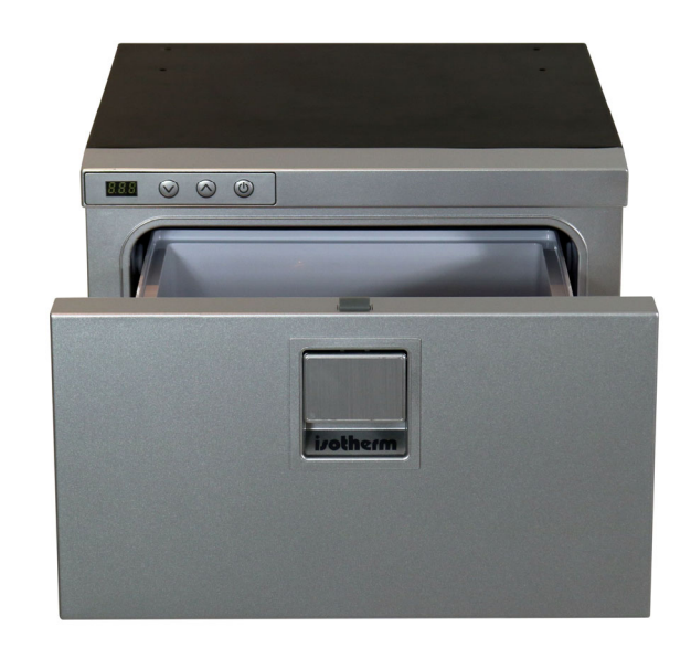
DR 16 FRIDGE / FREEZER