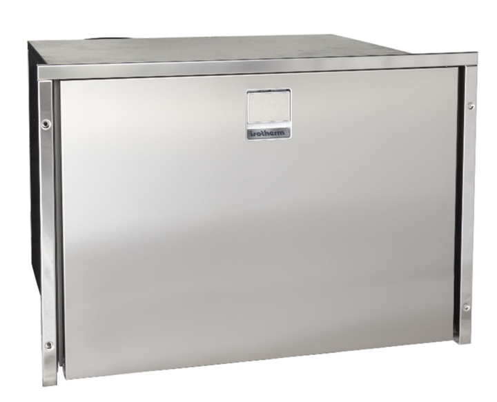
DR 70 FRIDGE / FREEZER