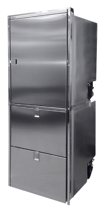
INOX Combi 320 Cruise 160 INOX on top of a Drawer 160 fridge or freezer or fridge/freezer + ice maker