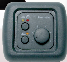
Diesel Cooker X 100 control