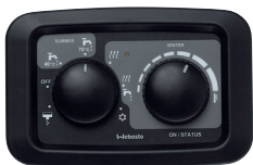
Manual (Standard) Control Panel

The Manual Control Panel allows selection of various heating modes for domestic water and air heating, boiler drainage and anti-freeze function.