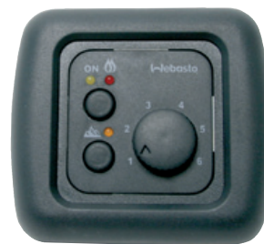
Diesel Cooker X 100 control